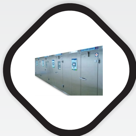
Walk In Stability Chamber