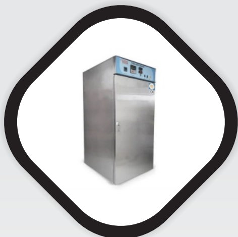
Cold Stability Chamber