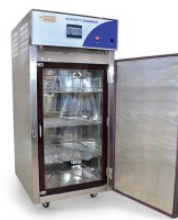
Industrial Stability Chamber