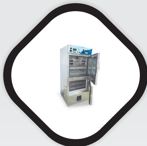
Dual Stability Chamber