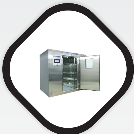
Eco Smart Walk In Stability Chamber